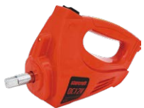
65190001 12V DC Impact Wrench with 12.7mm|1/2" drive for quick changing flat tires