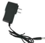
65170001 AC Battery charger adapter