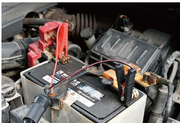
Car Battery: More Stable