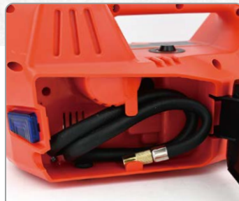
Built-in Tyre inflator