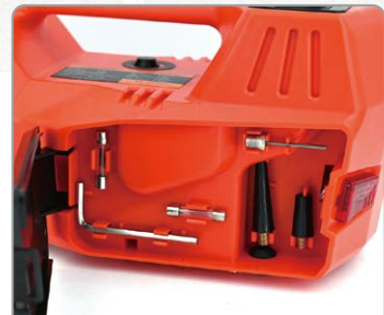
All necessary accessories