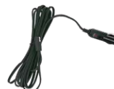
65170002 DC power line with car cigarette lighter plug 3.5meters/12ft