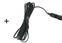
65170002 DC power line with car cigarette lighter plug 3.5meters/12ft