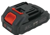
65180001 Lithium Battery 12V 6000mAh