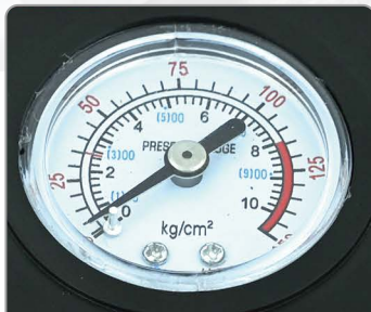
Tyre Pressure Monitoring