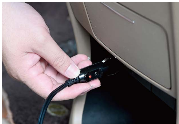
Cigarette Lighter: More Convenient