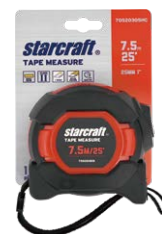
PACKED IN PAPER HANGER