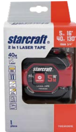
PACKED IN COLOR PAPER BOX