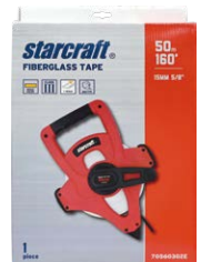
PACKED IN COLOR PAPER BOX