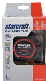
PACKED IN COLOR PAPER BOX