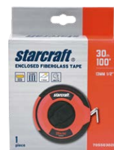
PACKED IN COLOR PAPER BOX