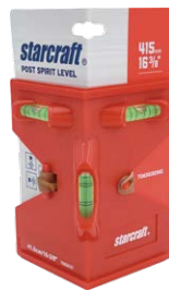
PACKED IN PAPER HANGER