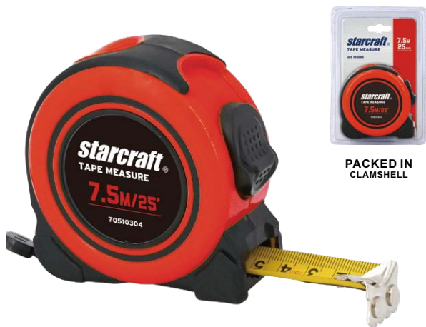
PACKED IN CLAMSHELL