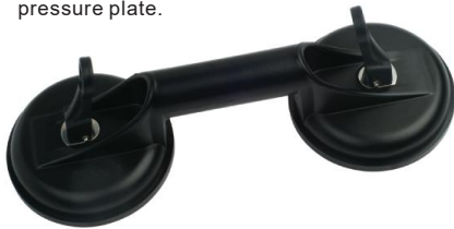
Item No. 33000002E