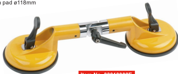
Item No. 33010002E