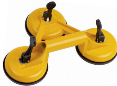
Item No. 33000003E