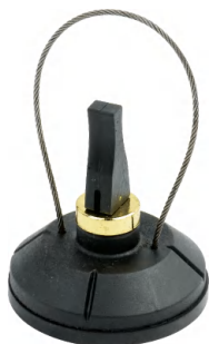
Item No. 33100001E