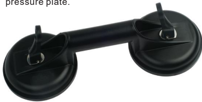
Item No. 33000002E