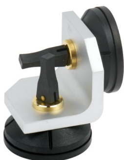
Item No. 33020002E

APPLICATION: For the fixation of two glass plates at right angle.