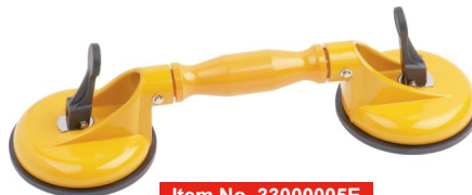
Item No. 33000005E