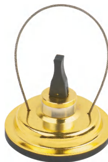
Item No. 33100002E

Finger lifter ideal for sucking and removing light and thin glass plate. Always handy and ready for use, yet leaves hand free for other work.