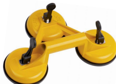
Item No. 33000003E