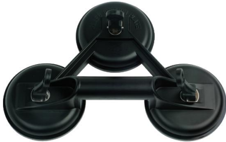
Item No. 33000001E