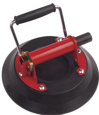
Item No. 33030004E