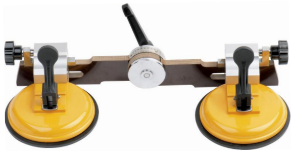
Item No. 33010001E