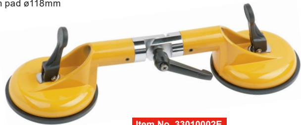
Item No. 33010002E