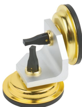
Item No.: 33020003E