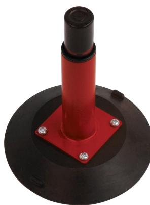
Item No. 33030008E

Vacuum Suction Lifter with Vertical Handle Especially suitable for windscreen installation, however the unit can be applied to many lifting tasks.