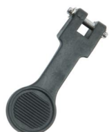
TRIGGER & PIN