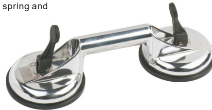
Item No. 33000004E