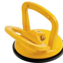
Item No. 33000006E